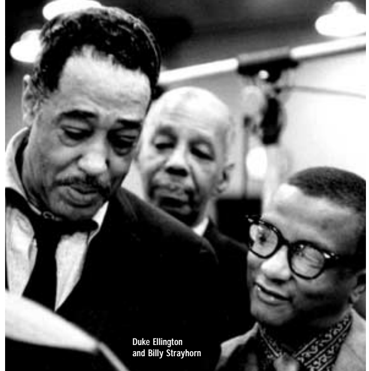
Duke Ellington and Billy Strayhorn